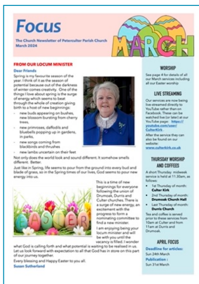
Culter Kirk Newsletter