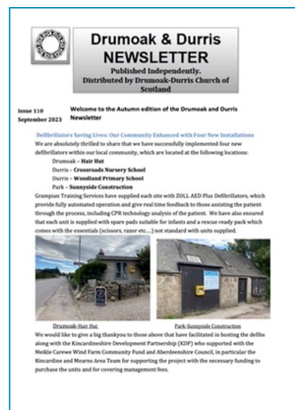
Drumoak & Durris Church/Community Newsletter