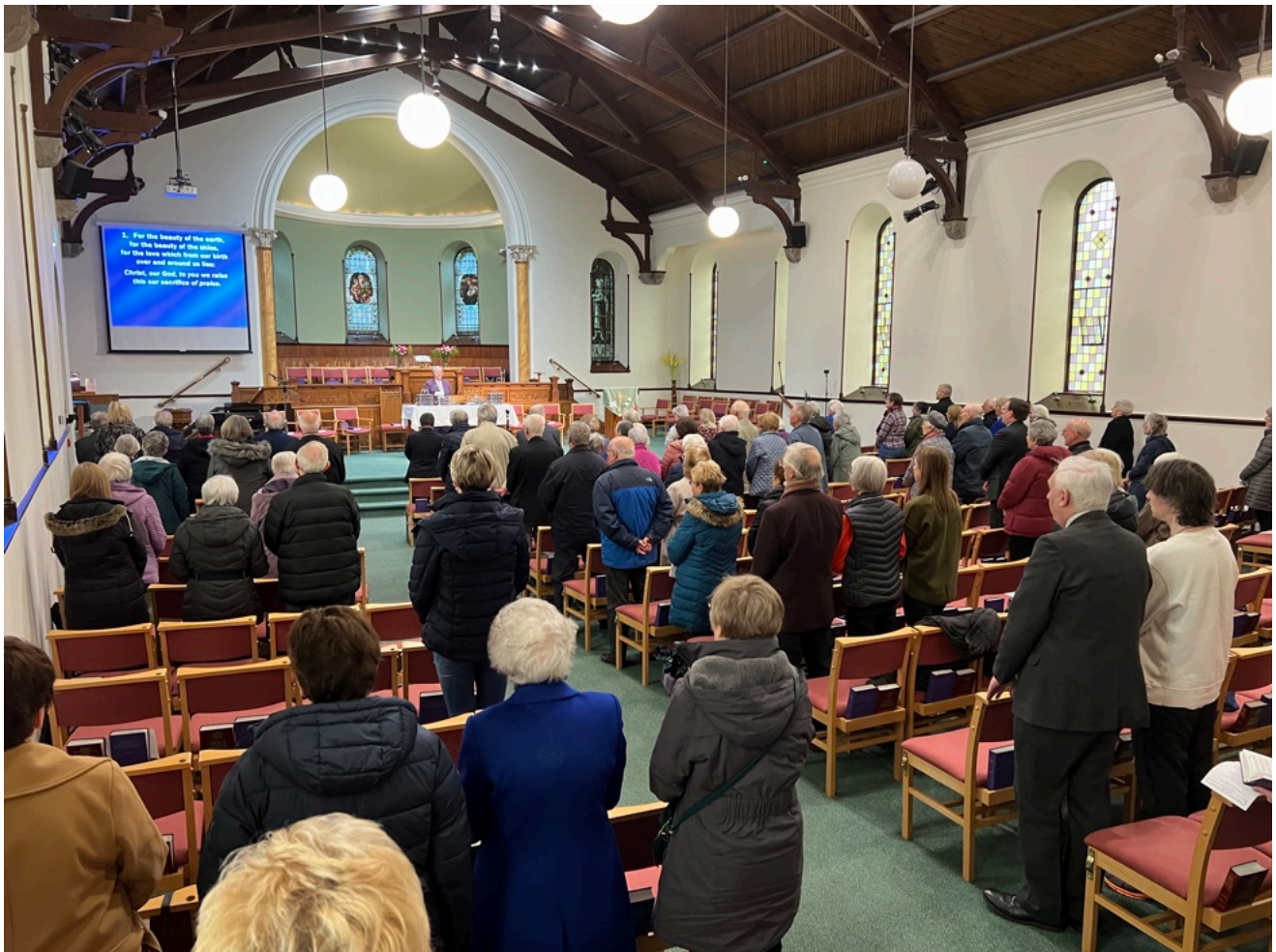
Service in Culter Kirk

Following the union we are now able to call a full time Minister of Word and Sacrament.