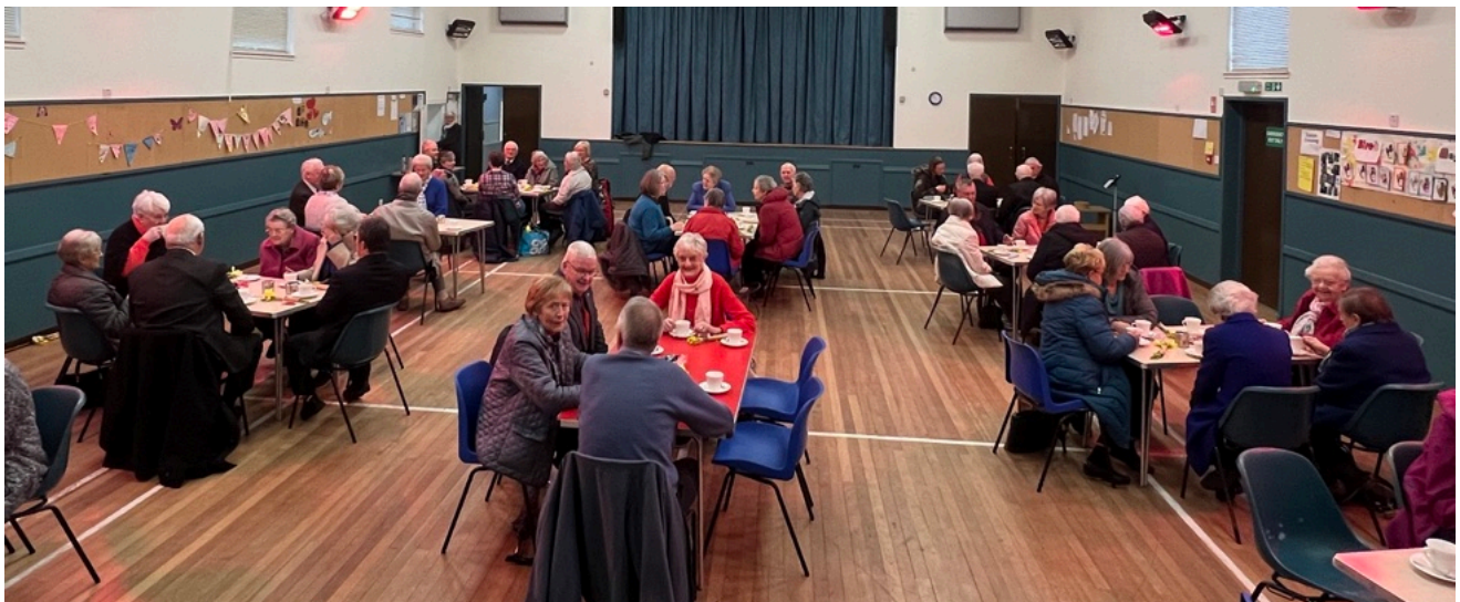
Continued fellowship following Sunday morning worship in Culter Kirk Hall

Culter Kirk Hall already serves as a social centre, providing a tea and coffee service on a Saturday and Thursday and is also used for the local 'Warm Space' initiative. Drumoak Church Hall hosts a Seniors' Friendship Group and the 'Drum Tots' parent and child group.