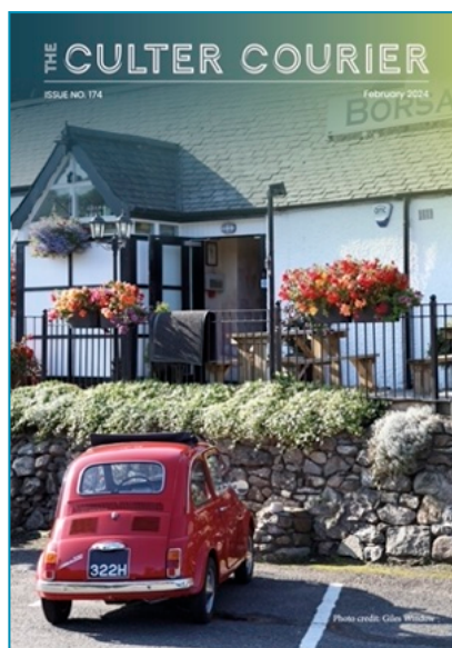
Culter Community Newsletter