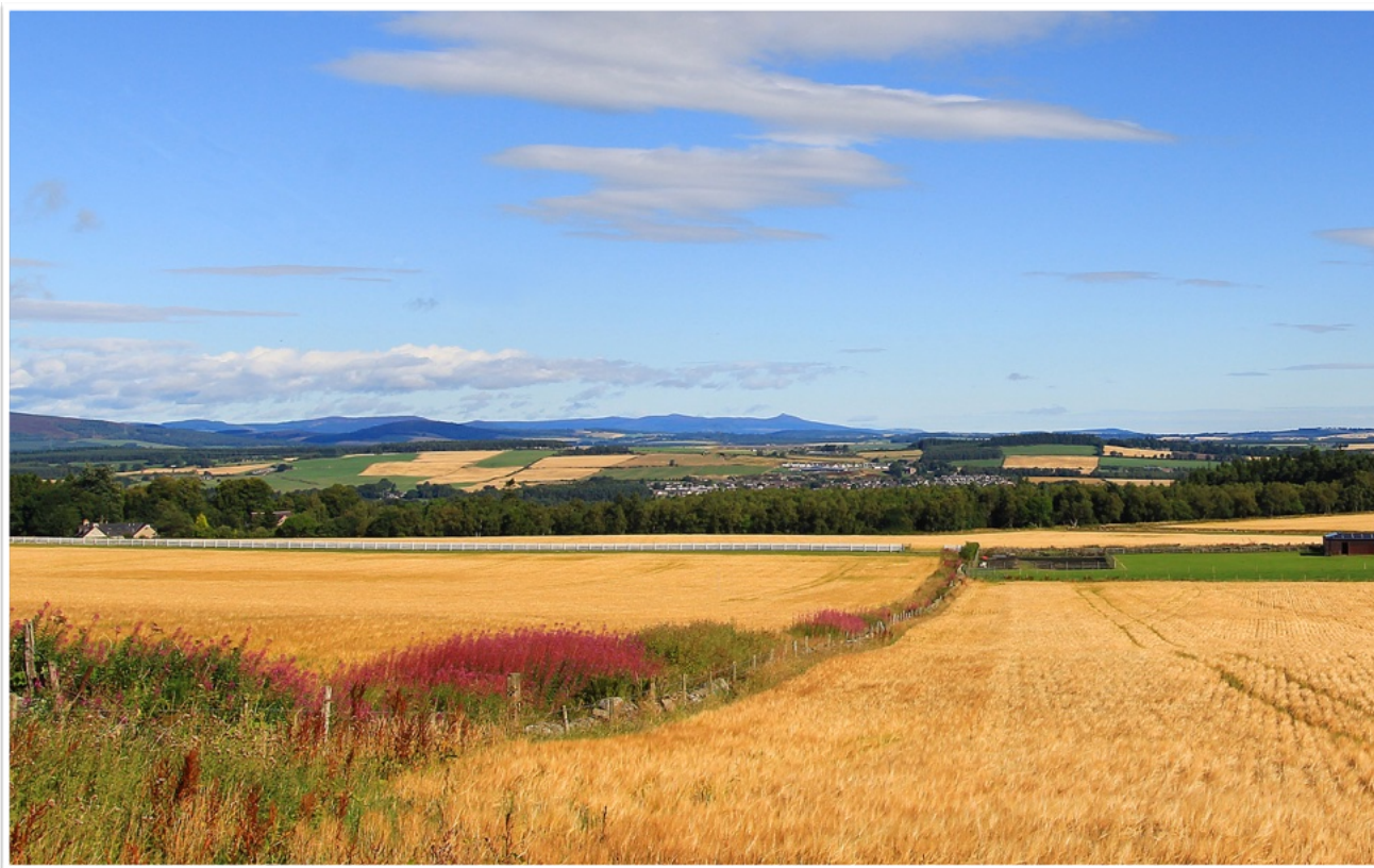
View of Drumoak from Durris

We are so very fortunate to live in such a scenic part of the world with excellent transport connections and where visiting Royal Deeside, coastal towns, villages, beaches, spectacular cliffs and historic castles is so easy.