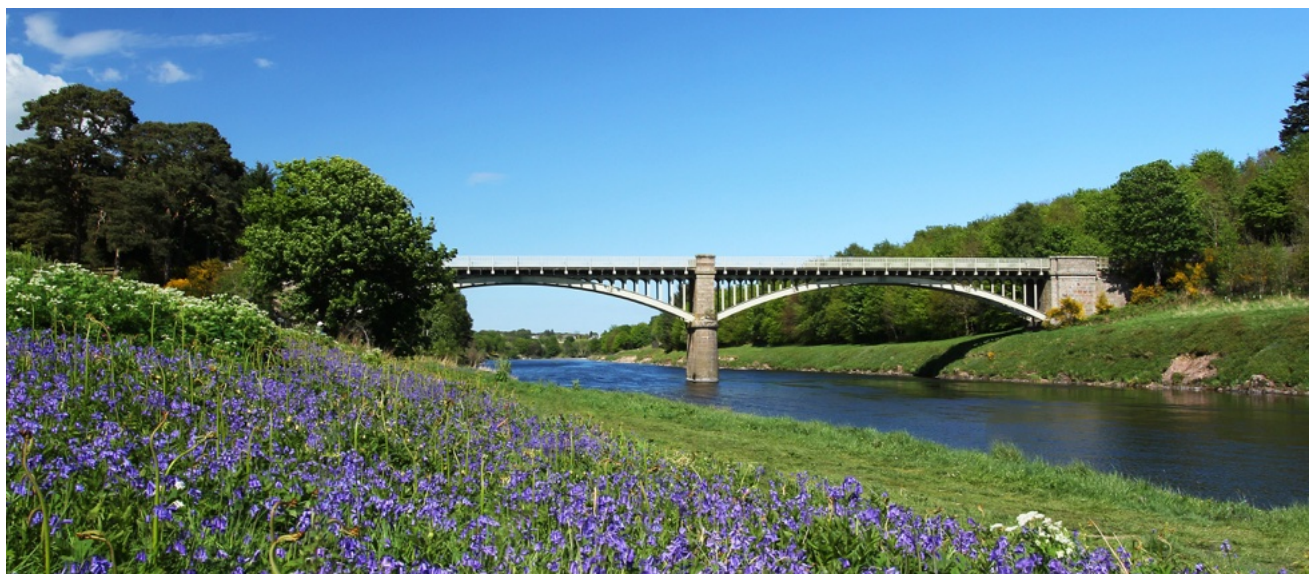
Park Bridge - linking Drumoak and Durris

A real sense of community exists and local events are generally well supported.