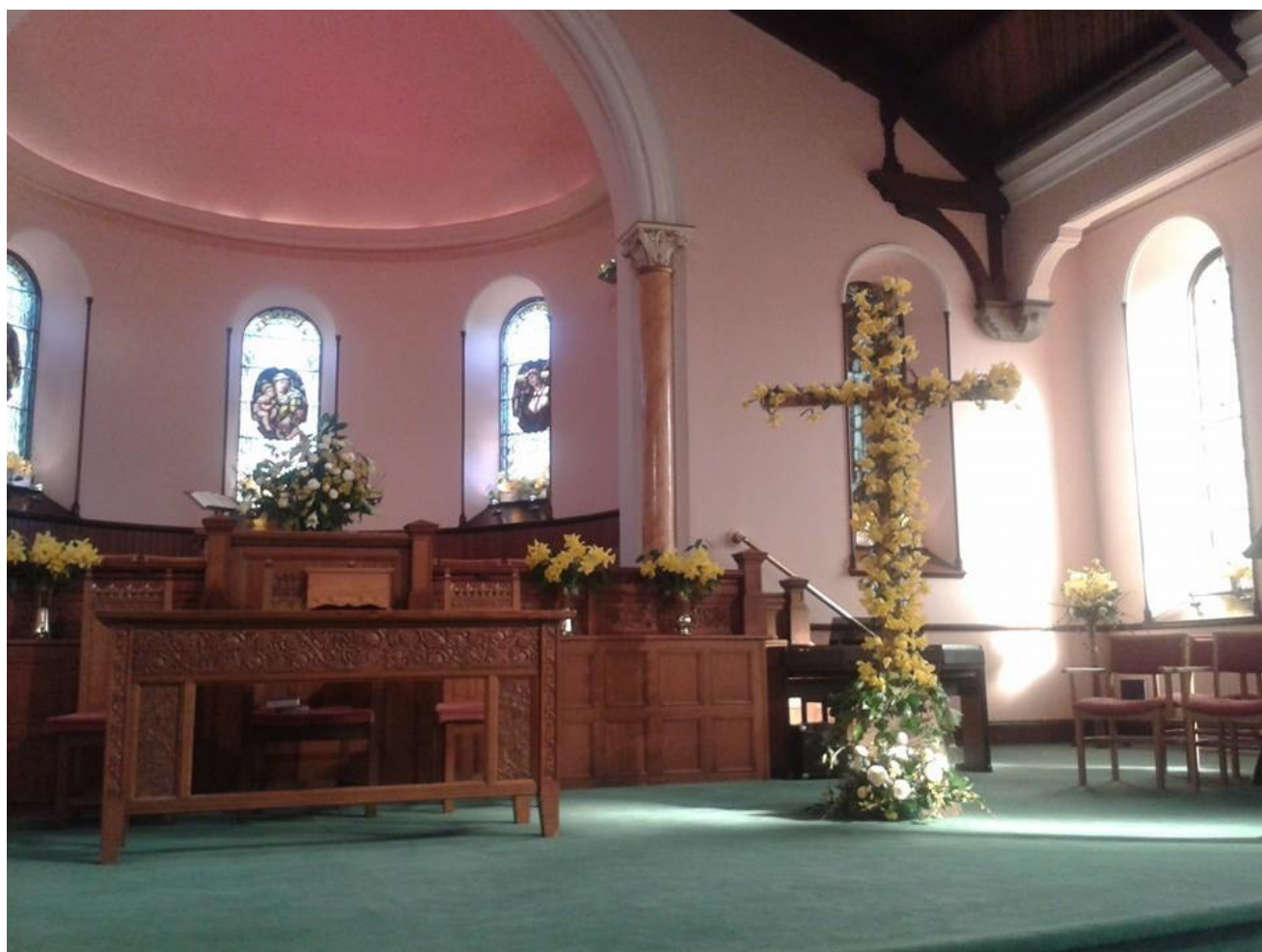
Culter Kirk at Easter Time

At that year end unrestricted local reserves were approximately £234k, excluding restricted and endowment funds of around £35k. In addition to these locally held funds there are further capital funds of £302k and revenue funds of £44k held on behalf of the congregation by the Church of Scotland General Trustees. In due course these capital funds will be increased following the disposal of the second manse and redundant church buildings.