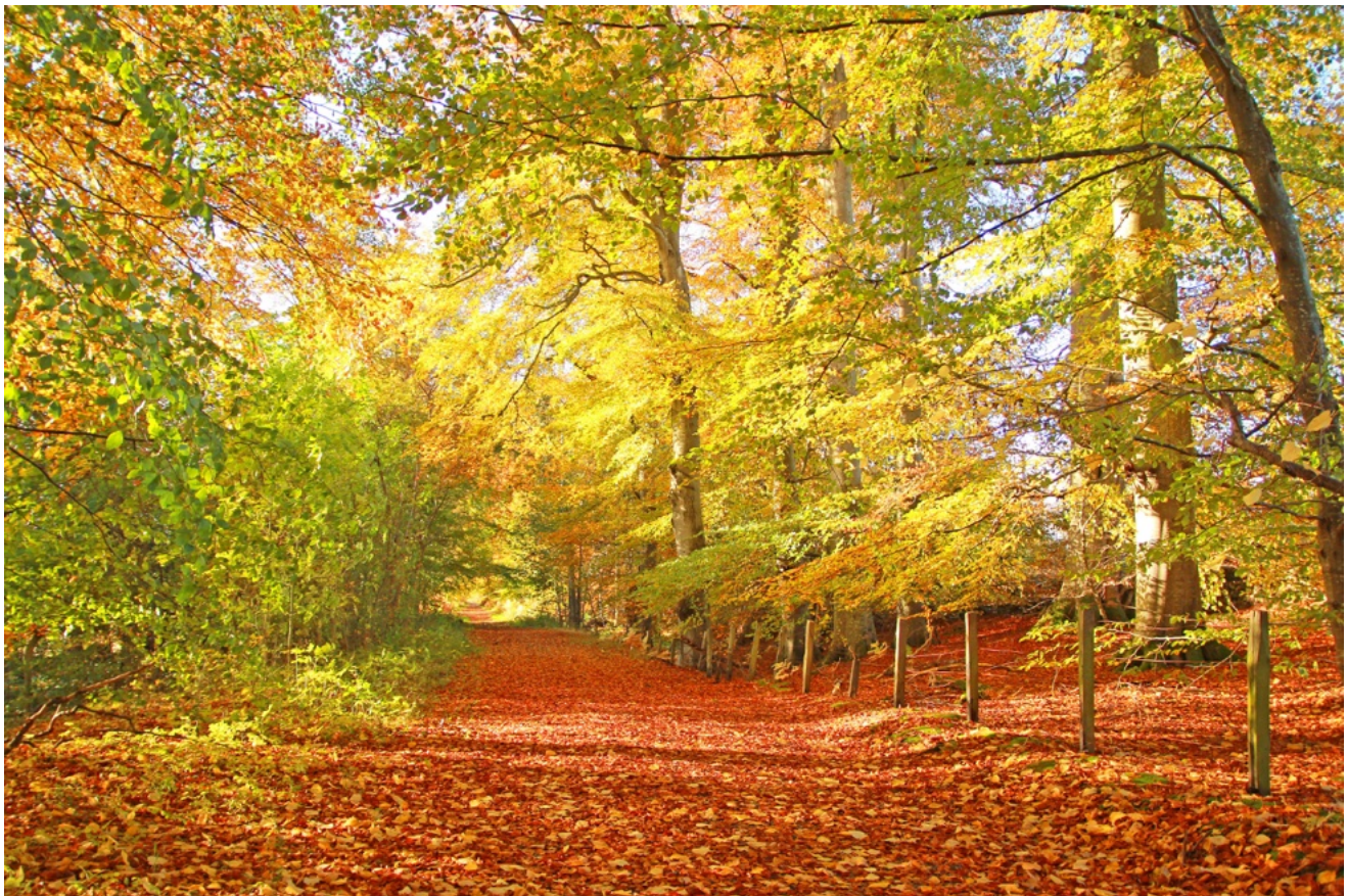
The Deeside Way

Additionally, three members on monthly rotation operate the audio-visual desk during each service and a Door Duty rota exists for two Welcome Elders and two Collection Count Elders each Sunday.