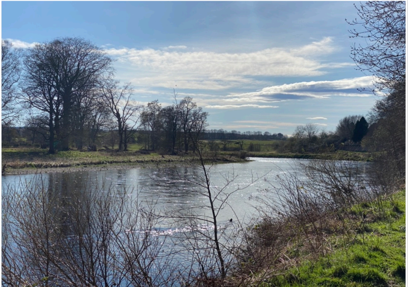
River Dee at Peterculter

See, I have placed before you an open door Revelation 3:8